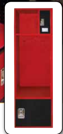
Hill Air Force Base, Utah. Shown with field supplied pads. Pads not included.

Lockers can also be custom painted in Flight Squadron colors.